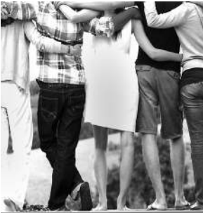
SOBER & OUT Lesbian, Gay, Bisexual and Transgender A.A. Members Share Their Experience, Strength and Hope

“Sober and Out” will be the book on sale for the month of November. Retail price on this book is $12.50 and the sale price will be $10 + tax.